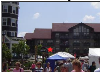
View of home from Village