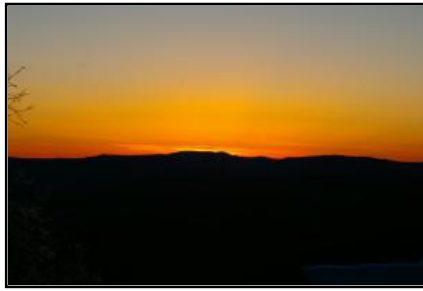
23 NORTH WEST RIDGE, SNOWSHOE, WV 26209 List #08-837

Amazing views of the Western territory and sunset. This downhill lot, could be purchased with lot 22. Some fill dirt has been moved onto the site, as it will be needed to build with. Owner financing available to qualified buyers. Make an offer!