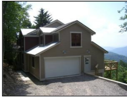
11 NORTH WEST RIDGE, SNOWSHOE, WV 26209