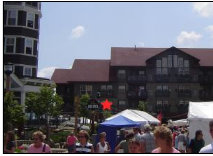
224 RIMFIRE, SNOWSHOE, WV 26209 List #08-832

Junior Studio in Rimfire Lodge, with view of the Village and slopes. This home sits above Starbucks and was renovated (new carpet & paint) in Nov 2007. It is ski in /ski out, and just steps from Split Rocks Aqua Center and all the restaurants and shops. It fully furnished, w/dvd & 32' tv. It located on the 2nd floor, easy access to ski storage, hot tub & spa, elevator and parking garage.