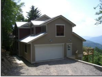
Exterior: looking over Valley