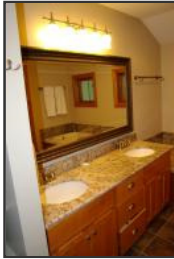
Master bath: Granite & custom shower