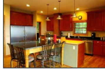
Cherry cabinets, commercial appliances