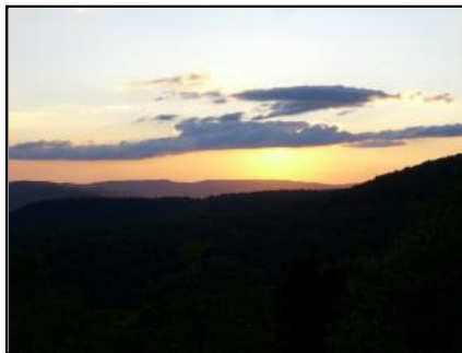
22 NORTH WEST RIDGE, SNOWSHOE, WV 26209